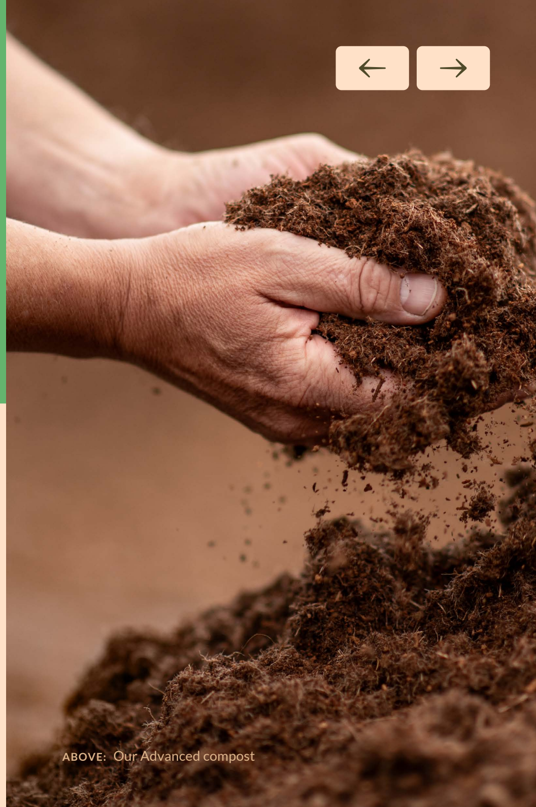
ABOVE: Our Advanced compost