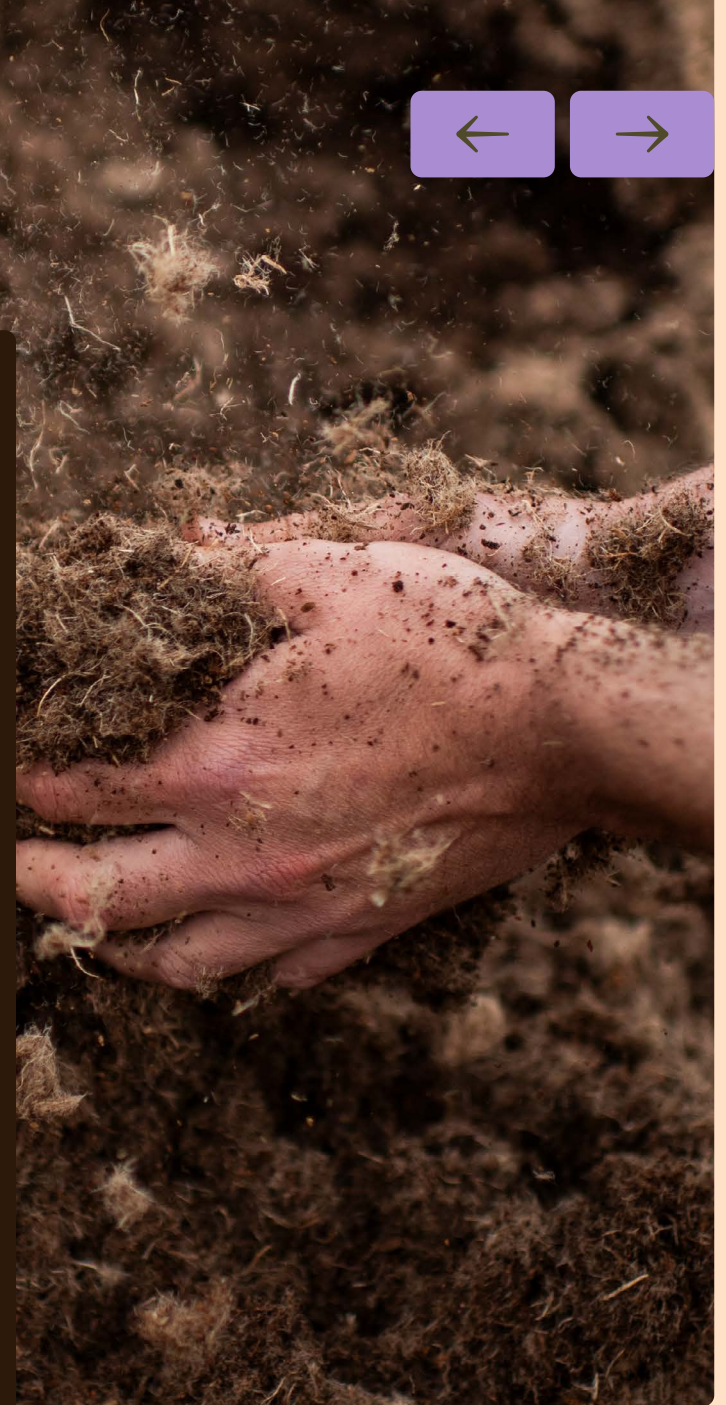
ABOVE: Our Gro Fibre mix